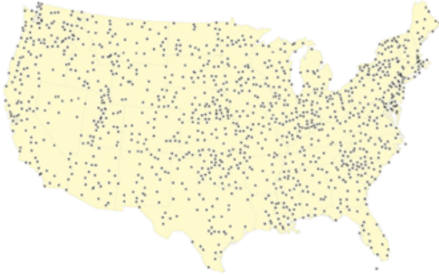
(a) USHCN (1218地点)

??NOAA??USHCN??1218??1a????????????????14????????????????1b??2005????? ????????????????????USHCN????????????????????????????????1a??USCRN????????? ????????????????????????????????????????1b????????????????????????????