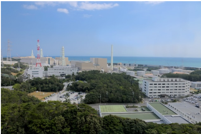
Photo 1. Full skyline view of Hamaoka Nuclear Power Station