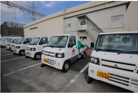
Photo 10. Mini trucks equipped with portable power pumps

Hamaoka Nuclear Power Station also draws seawater for cooling. As preparedness against flooding that affects the outdoor seawater intake pumps, other pumps with the same capacity will be installed inside the waterproof building with an underground water cistern. The emergency intake facility from a nearby river that was previously in place is being planned to be upgraded also.