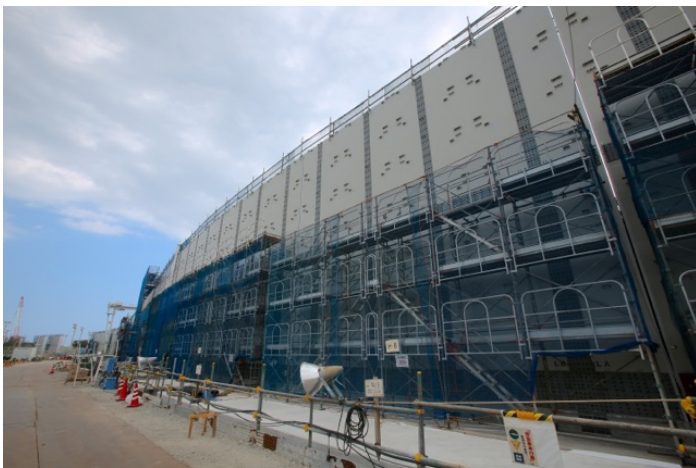
Photo 5. Massive 12-meter high seawall

Three stages of additional tsunami countermeasures are in progress. The first is flooding prevention of the site. Behind the dune embankment, a massive seawall is under construction along an extended oceanfront run of 1.6 kilometers, rising 10 to 12 meters above ground and made 2 meters thick. A foundation 15 to 40 meters deep underground supports the seawall, and can withstand the force of tsunami. The top of the wall is approximately 18 meters above sea level. The enormity brings the Great Wall of China to mind.