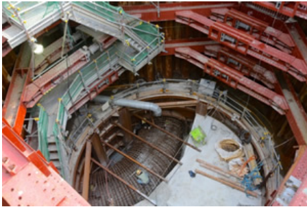
Photo 11. Installation of tunnel connecting to the emergency water intake facility

Hamaoka Nuclear Power Station also draws seawater for cooling. As preparedness against flooding that affects the outdoor seawater intake pumps, other pumps with the same capacity will be installed inside the waterproof building with an underground water cistern. The emergency intake facility from a nearby river that was previously in place is being planned to be upgraded also.