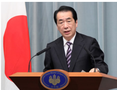
Photo 2. Prime Minister Naoto Kan at press conference on shutdown request of Hamaoka Nuclear Power Station

“I have requested Chubu Electric Power to shut down all the nuclear reactors at Hamaoka Nuclear Power Station. This considers the safety and security of all citizens in the nation.”