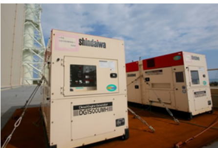
Photo 9. Emergency generators installed at intermediate level of reactor building

Combined ingenuity is at work to maintain reactor cooling under any set of circumstances. Power generators as the source of emergency power in a disaster are placed at the intermediate height of reactor buildings. A gas turbine generator and storehouse for emergency supplies and equipment are under construction 40 meters above sea level on a high ground. Portable power pumps are on-site in the event of power loss during a disaster, and have also been housed on the high ground.