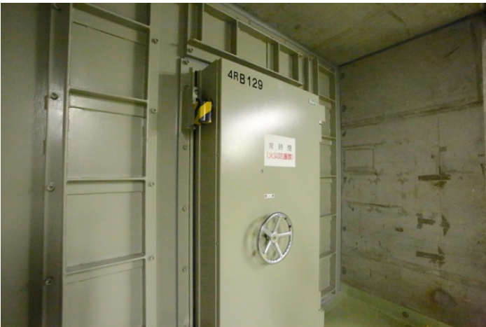
Photo 8. Watertight doors for critical areas

In addition, prevention of flooding into the reactor buildings has been implemented. Major entrances have double doors that are waterproof. “Critical areas can be sealed like a submarine,” according to Chubu Electric Power personnel in charge.