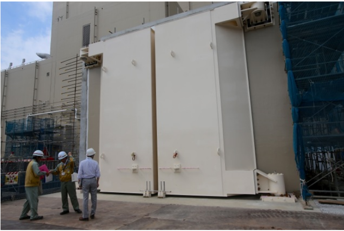
Photo 7. Doors now doubled on the reactor building

In addition, prevention of flooding into the reactor buildings has been implemented. Major entrances have double doors that are waterproof. “Critical areas can be sealed like a submarine,” according to Chubu Electric Power personnel in charge.